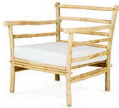
MALIE sofa for 1 W71cm x L70cm x H35/80cm