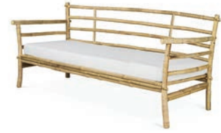
MALIE sofa for 3 W190cm x L70cm x H35/80cm