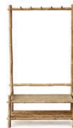
MOHALA dress hanger W100cm x L37cm x H180cm

*The images are for illustration purposes only. There may be variations in size. Some products may require self-assembly.