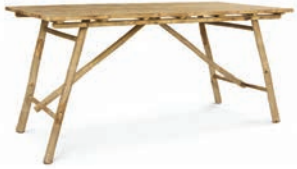
LUANA folding table W220cm x L80cm x H70cm W170cm x L80cm x H70cm