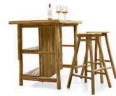
KANOA bar set W160cm x L50cm x H90cm WL42cm x H68cm x 2脚