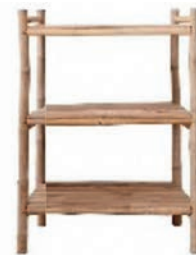
AINA shelf W80cm x L30cm x H110cm