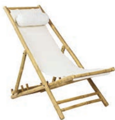
NALU reclining chair W63cm x L110cm x H110cm