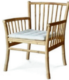
LEI dining chair with arm W58cm x L58cm x H40/78 cm