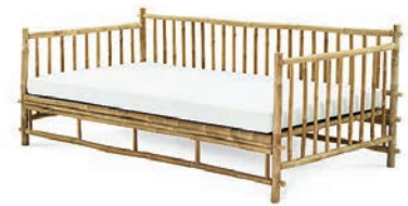
LANI daybed W212cm x L103cm x H80cm