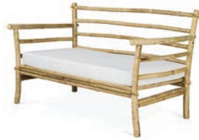
MALIE sofa for 2 W130cm x L70cm x H35/80cm