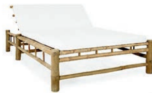
AKALA sunbed for 2 W156cm x L210cm x H35cm