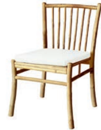
LEI dining chair armless W54cm x L50cm x H40/78cm