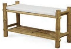
PUKA shoe bench W89cm x L35cm x H50cm