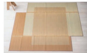
ULU tatami rug 200 cm x 176 cm

*The images are for illustration purposes only. There may be variations in size. Some products may require self-assembly.