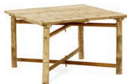
KAI low table W70cm x L70cm x H45cm