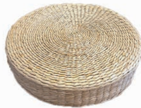
PIKO NATURAL meditation cushion W45cm x L45cm x H10cm