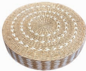
PIKO WHITE meditation cushion W45cm x L45cm x H10cm