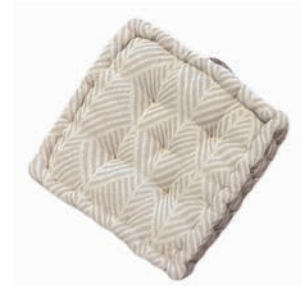
PALUPALU picnic cushion W42cm x L42cm x H10cm