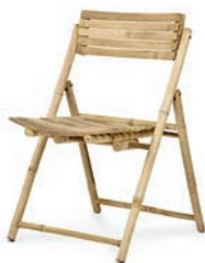
MILIMILI folding chair W52cm x L63cm x H82cm