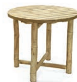
HOALOHA side table W55cm x L55cm x H40cm

*The images are for illustration purposes only. There may be variations in size. Some products may require self-assembly.