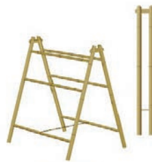
LAKI towel stand W103cm x L82 cm x H111cm