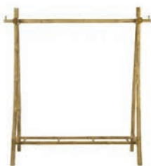
MELIA cloth rack W90cm x L37cm x H143cm W120cm x L49cm x H170cm