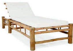
AKALA sunbed for 1 W106cm x L210cm x H35cm